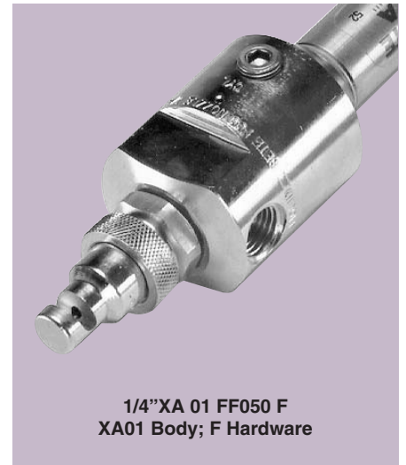
1/4"XA 01 FF050 F XA01 Body; F Hardware